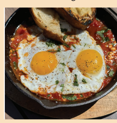
Toast not included with this item.

Add an egg 3 Add avocado 3 Carnivore-ize it! 4 Add chorizo & linguica